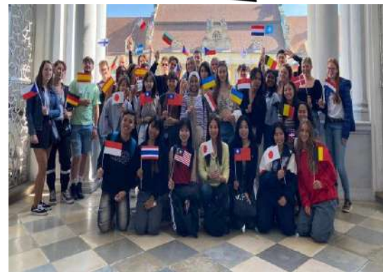
#41 exchange students from 23 country