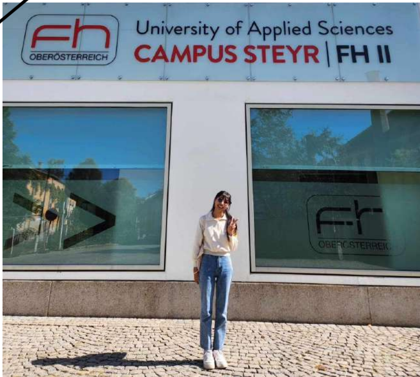
@ University of Applied Science CAMPUS STEYR