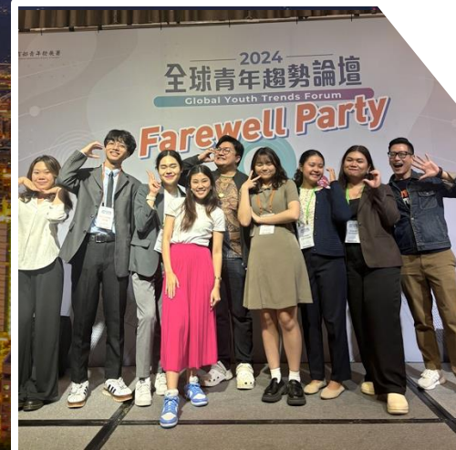
PATHS TO IMPACT