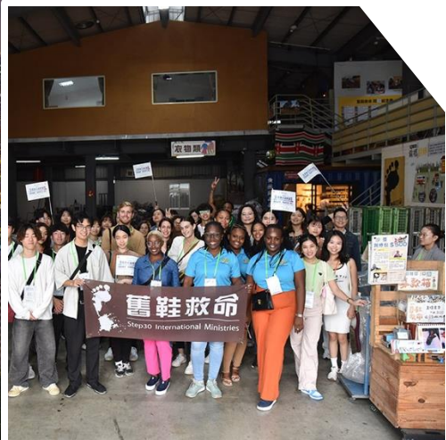
WAVES OF COMPASSIONS