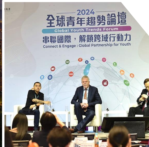
BRIDGE OF UNDERSTANDING