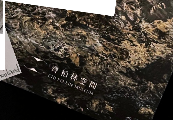
齊柏林空間 CHI PO-LIN MUSEUM