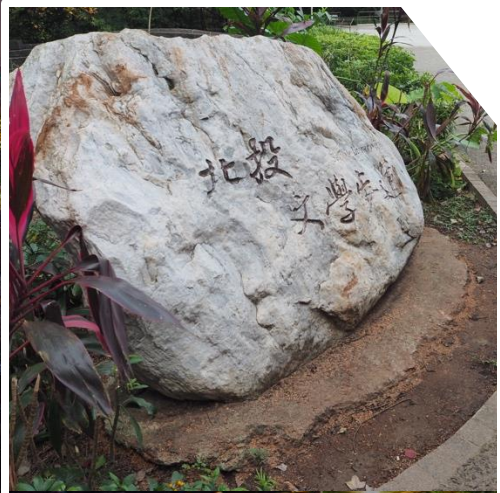
ECHOES OF THE PAST

Relive the moments as we explore, connect, and experience the forum.