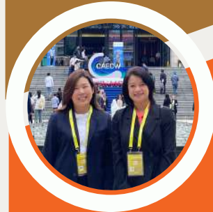
CIA team at CAECW 2023