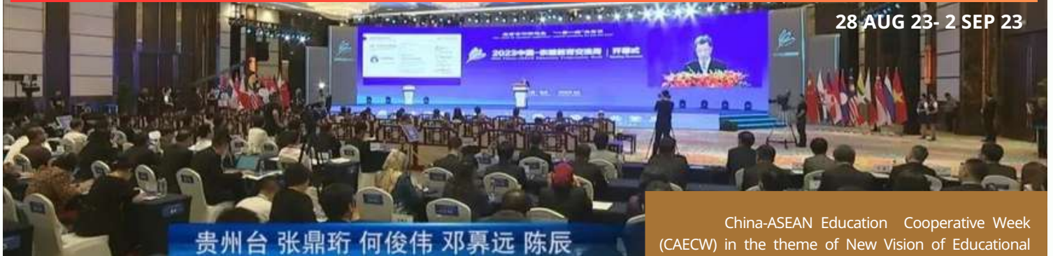
贵州台 张鼎珩 何俊伟 邓鼻远 陈辰